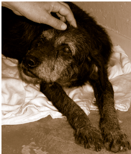
Momma Mabel's first gentle human touch.

The neighbors called about hungry dogs killing their pets, chickens, goats. Along with a Pawnee County Sheriff's deputy, we went to the residence west of Keystone Lake and found these animals living inside a narrow, small trailer house.